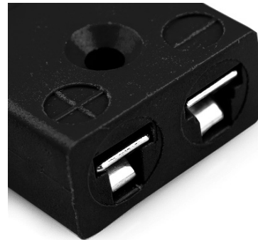
Miniature in-line Socket (dimensions in mm)

Labfacility are the UK's leading manufacturer of Temperature Sensors, Thermocouple Connectors and associated Temperature Instrumentation and stockings of Thermocouple Cables. The Company has been trading since 1971 and is ISO9001 accredited.