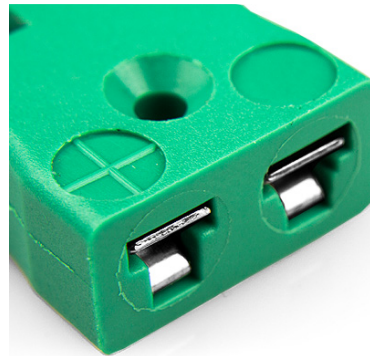
Miniature in-line Socket - Quick Wire (dimensions in mm)

Labfacility are the UK's leading manufacturer of Temperature Sensors, Thermocouple Connectors and associated Temperature Instrumentation and stockings of Thermocouple Cables. The Company has been trading since 1971 and is ISO9001 accredited.