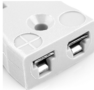
Miniature in-line Socket - Quick Wire (dimensions in mm)

Labfacility are the UK's leading manufacturer of Temperature Sensors, Thermocouple Connectors and associated Temperature Instrumentation and stockings of Thermocouple Cables. The Company has been trading since 1971 and is ISO9001 accredited.