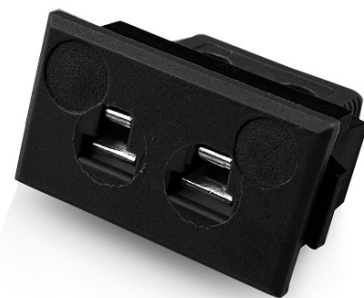
Miniature Fascia Socket (with nylon mounting clip) (dimensions in mm)

Labfacility are the UK's leading manufacturer of Temperature Sensors, Thermocouple Connectors and associated Temperature Instrumentation and stockings of Thermocouple Cables. The Company has been trading since 1971 and is ISO9001 accredited.