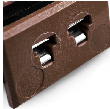
Miniature Fascia Socket (with nylon mounting clip) (dimensions in mm)

Labfacility are the UK's leading manufacturer of Temperature Sensors, Thermocouple Connectors and associated Temperature Instrumentation and stockings of Thermocouple Cables. The Company has been trading since 1971 and is ISO9001 accredited.