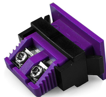
Miniature Fascia Socket (with nylon mounting clip) (dimensions in mm)

Labfacility are the UK's leading manufacturer of Temperature Sensors, Thermocouple Connectors and associated Temperature Instrumentation and stockings of Thermocouple Cables. The Company has been trading since 1971 and is ISO9001 accredited.