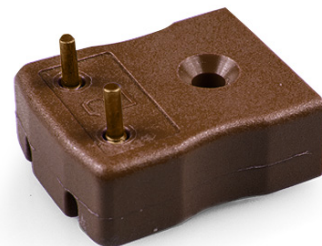
Miniature PCB Socket (dimensions in mm)

Labfacility are the UK's leading manufacturer of Temperature Sensors, Thermocouple Connectors and associated Temperature Instrumentation and stockings of Thermocouple Cables. The Company has been trading since 1971 and is ISO9001 accredited.