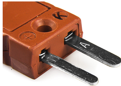
Miniature Hi-Temp Plastic in-line Plug - HTP (dimensions in mm)

Labfacility are the UK's leading manufacturer of Temperature Sensors, Thermocouple Connectors and associated Temperature Instrumentation and stockings of Thermocouple Cables. The Company has been trading since 1971 and is ISO9001 accredited.