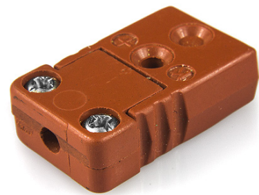
Miniature Hi-Temp Plastic in-line Socket - HTP (dimensions in mm)

Labfacility are the UK's leading manufacturer of Temperature Sensors, Thermocouple Connectors and associated Temperature Instrumentation and stockings of Thermocouple Cables. The Company has been trading since 1971 and is ISO9001 accredited.