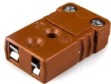
Miniature Hi-Temp Plastic in-line Socket - HTP (dimensions in mm)

Labfacility are the UK's leading manufacturer of Temperature Sensors, Thermocouple Connectors and associated Temperature Instrumentation and stockings of Thermocouple Cables. The Company has been trading since 1971 and is ISO9001 accredited.