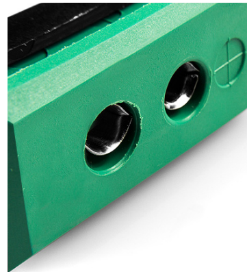
Standard Fascia Socket (with nylon mounting clip) (dimensions in mm)

Labfacility are the UK's leading manufacturer of Temperature Sensors, Thermocouple Connectors and associated Temperature Instrumentation and stockings of Thermocouple Cables. The Company has been trading since 1971 and is ISO9001 accredited.