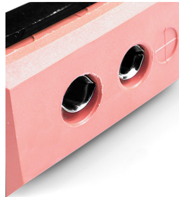
Standard Fascia Socket (with nylon mounting clip) (dimensions in mm)

Labfacility are the UK's leading manufacturer of Temperature Sensors, Thermocouple Connectors and associated Temperature Instrumentation and stockings of Thermocouple Cables. The Company has been trading since 1971 and is ISO9001 accredited.