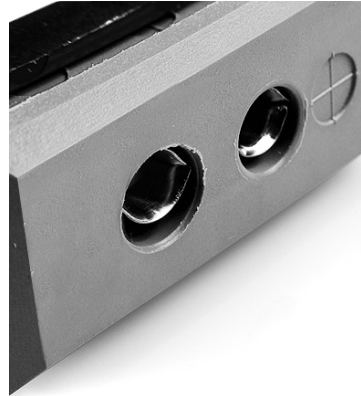
Standard Fascia Socket (with nylon mounting clip) (dimensions in mm)

Labfacility are the UK's leading manufacturer of Temperature Sensors, Thermocouple Connectors and associated Temperature Instrumentation and stockings of Thermocouple Cables. The Company has been trading since 1971 and is ISO9001 accredited.