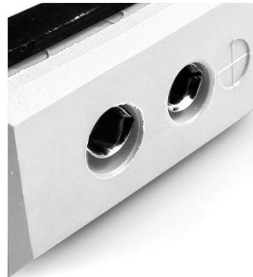
Standard Fascia Socket (with nylon mounting clip) (dimensions in mm)

Labfacility are the UK's leading manufacturer of Temperature Sensors, Thermocouple Connectors and associated Temperature Instrumentation and stockings of Thermocouple Cables. The Company has been trading since 1971 and is ISO9001 accredited.