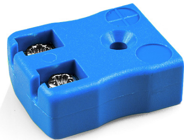
Miniature in-line Socket - Quick Wire (dimensions in mm)

Labfacility are the UK's leading manufacturer of Temperature Sensors, Thermocouple Connectors and associated Temperature Instrumentation and stockings of Thermocouple Cables. The Company has been trading since 1971 and is ISO9001 accredited.