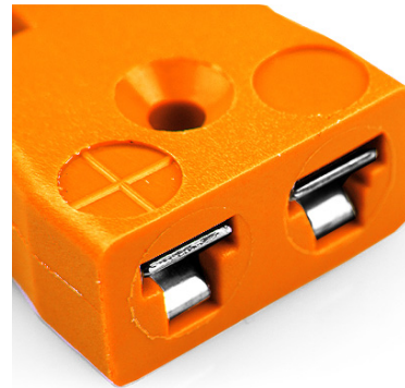
Miniature in-line Socket - Quick Wire (dimensions in mm)

Labfacility are the UK's leading manufacturer of Temperature Sensors, Thermocouple Connectors and associated Temperature Instrumentation and stockings of Thermocouple Cables. The Company has been trading since 1971 and is ISO9001 accredited.