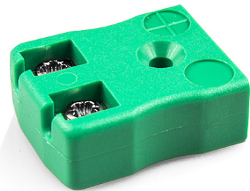
Miniature in-line Socket - Quick Wire (dimensions in mm)

Labfacility are the UK's leading manufacturer of Temperature Sensors, Thermocouple Connectors and associated Temperature Instrumentation and stockings of Thermocouple Cables. The Company has been trading since 1971 and is ISO9001 accredited.