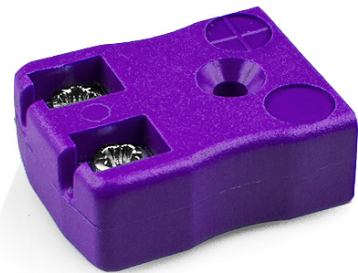
Miniature in-line Socket - Quick Wire (dimensions in mm)

Labfacility are the UK's leading manufacturer of Temperature Sensors, Thermocouple Connectors and associated Temperature Instrumentation and stockings of Thermocouple Cables. The Company has been trading since 1971 and is ISO9001 accredited.