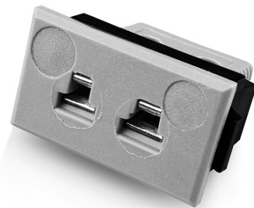
Miniature Fascia Socket (with nylon mounting clip) (dimensions in mm)

Labfacility are the UK's leading manufacturer of Temperature Sensors, Thermocouple Connectors and associated Temperature Instrumentation and stockings of Thermocouple Cables. The Company has been trading since 1971 and is ISO9001 accredited.