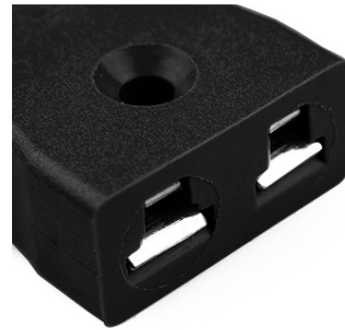
Miniature PCB Socket (dimensions in mm)

Labfacility are the UK's leading manufacturer of Temperature Sensors, Thermocouple Connectors and associated Temperature Instrumentation and stockings of Thermocouple Cables. The Company has been trading since 1971 and is ISO9001 accredited.