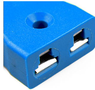
Miniature PCB Socket (dimensions in mm)

Labfacility are the UK's leading manufacturer of Temperature Sensors, Thermocouple Connectors and associated Temperature Instrumentation and stockings of Thermocouple Cables. The Company has been trading since 1971 and is ISO9001 accredited.