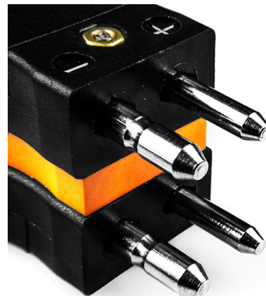
Standard Duplex in-line Plug (dimensions in mm)

Labfacility are the UK's leading manufacturer of Temperature Sensors, Thermocouple Connectors and associated Temperature Instrumentation and stockings of Thermocouple Cables. The Company has been trading since 1971 and is ISO9001 accredited.