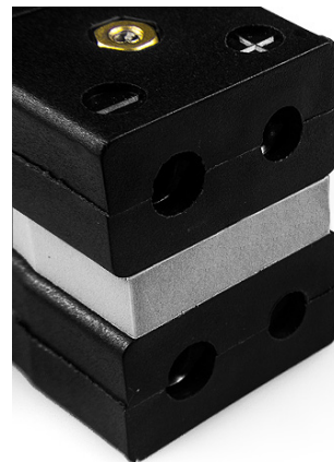
Standard Duplex in-line Socket (dimensions in mm)

Labfacility are the UK's leading manufacturer of Temperature Sensors, Thermocouple Connectors and associated Temperature Instrumentation and stockings of Thermocouple Cables. The Company has been trading since 1971 and is ISO9001 accredited.