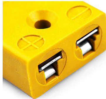
Miniature in-line Socket (dimensions in mm)

Labfacility are the UK's leading manufacturer of Temperature Sensors, Thermocouple Connectors and associated Temperature Instrumentation and stockings of Thermocouple Cables. The Company has been trading since 1971 and is ISO9001 accredited.