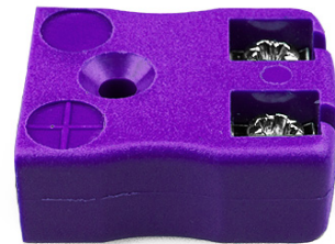
Miniature in-line Socket - Quick Wire (dimensions in mm)

Labfacility are the UK's leading manufacturer of Temperature Sensors, Thermocouple Connectors and associated Temperature Instrumentation and stockings of Thermocouple Cables. The Company has been trading since 1971 and is ISO9001 accredited.