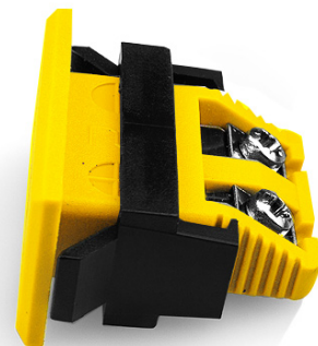
Miniature Fascia Socket (with nylon mounting clip) (dimensions in mm)

Labfacility are the UK's leading manufacturer of Temperature Sensors, Thermocouple Connectors and associated Temperature Instrumentation and stockings of Thermocouple Cables. The Company has been trading since 1971 and is ISO9001 accredited.