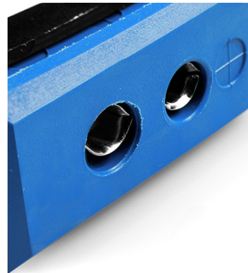
Standard Fascia Socket (with nylon mounting clip) (dimensions in mm)

Labfacility are the UK's leading manufacturer of Temperature Sensors, Thermocouple Connectors and associated Temperature Instrumentation and stockings of Thermocouple Cables. The Company has been trading since 1971 and is ISO9001 accredited.