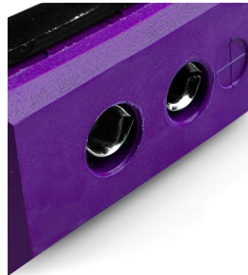
Standard Fascia Socket (with nylon mounting clip) (dimensions in mm)

Labfacility are the UK's leading manufacturer of Temperature Sensors, Thermocouple Connectors and associated Temperature Instrumentation and stockings of Thermocouple Cables. The Company has been trading since 1971 and is ISO9001 accredited.