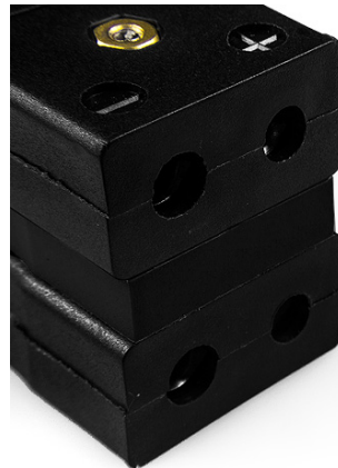
Standard Duplex in-line Socket (dimensions in mm)

Labfacility are the UK's leading manufacturer of Temperature Sensors, Thermocouple Connectors and associated Temperature Instrumentation and stockings of Thermocouple Cables. The Company has been trading since 1971 and is ISO9001 accredited.